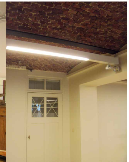
after / multipurpose room