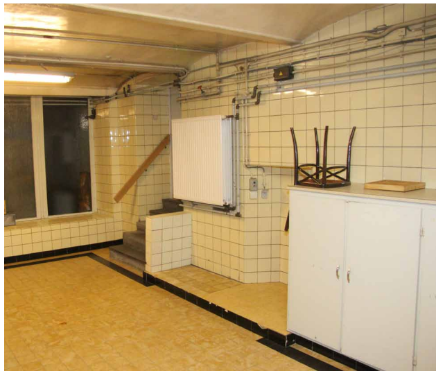
before / kitchen