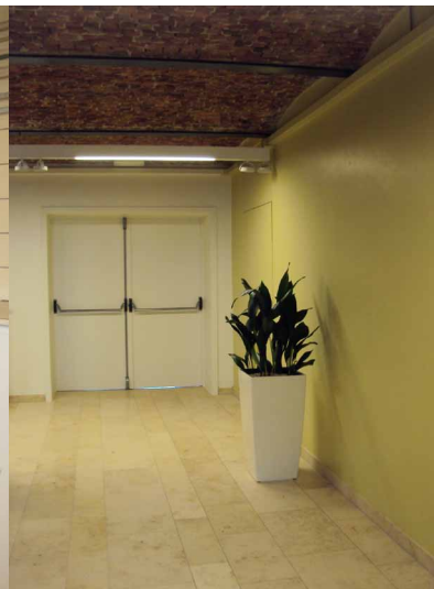
after / multipurpose room