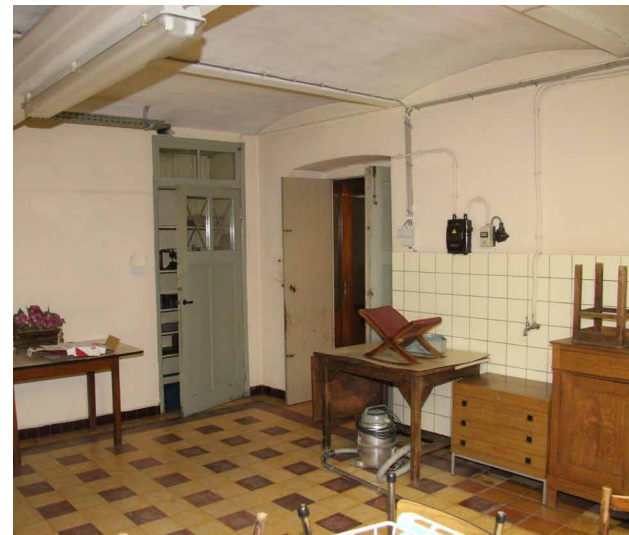
before / dining room