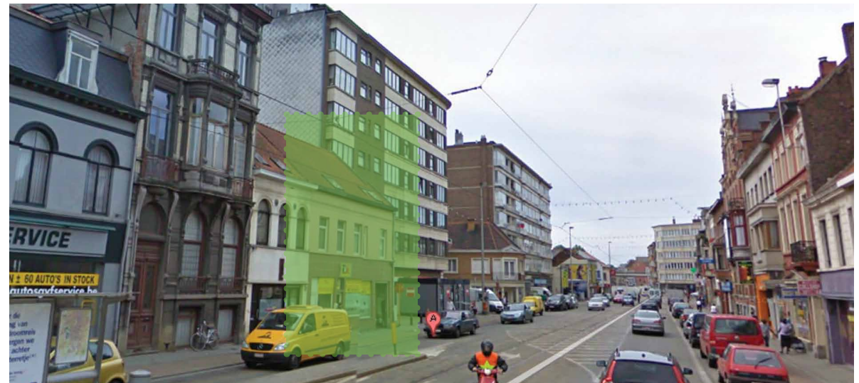
street view left